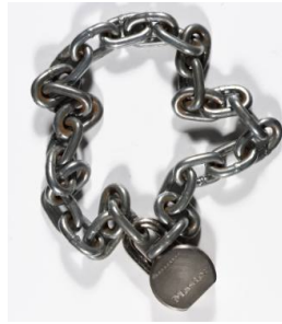
Title: Chain Link with Padlock Worn by Treach of Naughty by Nature Date: c. 1993 Primary Maker: Treach Medium: metal