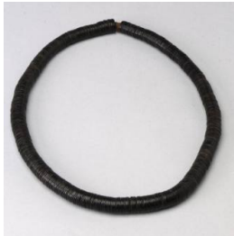
Title: Coconut Shell Necklace Formerly Owned by Professor X Date: c. 1990 Primary Maker: Professor X Medium: shell