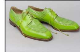
Title: Fa Cri Shoes Formerly Owned by Master P Date: c. 1998 Primary Maker: Fa Cri Medium: snakeskin, leather