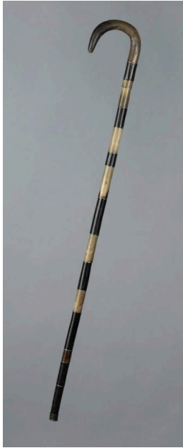
Title: Cane Formerly Owned by Professor X Date: c. 1990 Primary Maker: Professor X Medium: wood