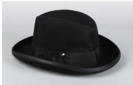
Title: Capas Design Godfather Hat Formerly Owned by The Notorious B.I.G. Date: 1994-1996 Primary Maker: Notorious B.I. G. Medium: wool