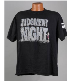
Title: Promotional T- shirt for Judgment Night