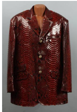
Title: 5001 Flavors Red Python Skin Suit and Hat Formerly Owned by Silkk the Shocker