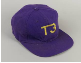
Title: T3 Baseball Cap Worn by Special K of The Treacherous 3 Date: c. 1994 Primary Maker: Special K Medium: cotton