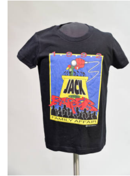
Title: 1992 Jack the Rapper Convention Shirt Date: 1992 Primary Maker: Jack the Rapper Medium: cotton (fiber)