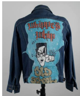
Title: Lee Jeans Jacket Worn by Prince Whipper Whip Date: c. 1980 Primary Maker: Prince Whipper Whip Medium: denim