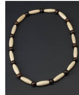
Title: Wood Bead Necklace Formerly Owned by Professor X