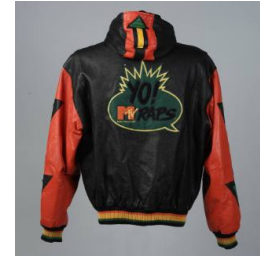
Title: Yo! MTV Raps promotional jacket Date: 1992 Primary Maker: MTV Networks Medium: vinyl; metal; polyester