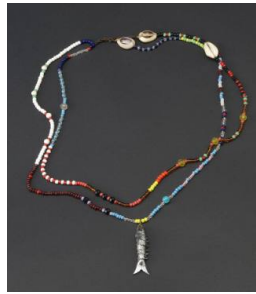
Title: Two-Strand Necklace Formerly Owned by Professor X