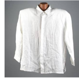
Title: Linen Dress Shirt Formerly Owned by The Notorious B.I.G. Date: 1994-1996 Medium: cotton