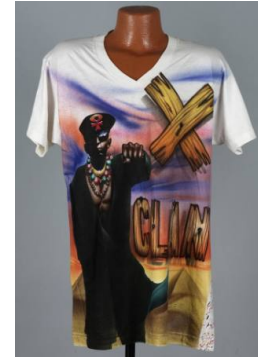
Title: X-Clan Airbrushed Shirt Date: 1990-1995 Primary Maker: Professor X Medium: cotton (textile)