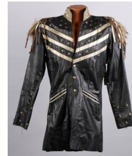
Title: Jacket Worn by Scorpio of Grandmaster Flash & The Furious Five