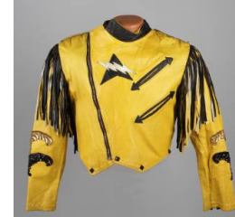
Title: "Creole" Leather Jacket Worn by The Kidd Creole Date: c. 1984 Primary Maker: The Kidd Creole Medium: leather