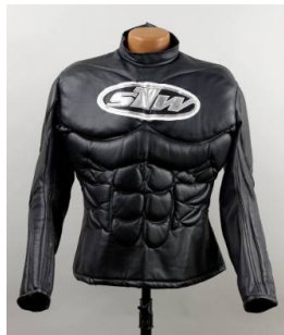
Title: Security of the First World Jacket Formerly Owned by Chuck D Date: c. 1990 Primary Maker: Public Enemy Medium: leather