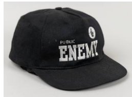
Title: Public Enemy Baseball Cap Formerly Owned by Chuck D