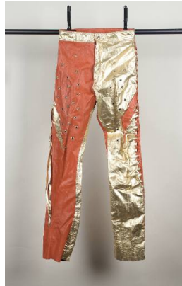
Title: Stage Trousers Formerly Owned by Scorpio of Grandmaster Flash & The Furious Five Date: c. 1985 Primary Maker: Scorpio Medium: leather