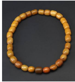
Title: Amber Necklace Formerly Owned by Professor X Date: c. 1990 Primary Maker: Professor X Medium: wood