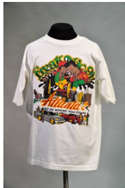
Title: Freaknik 1994 Beavis and Butthead Shirt Date: 1994 Medium: cotton (textile)