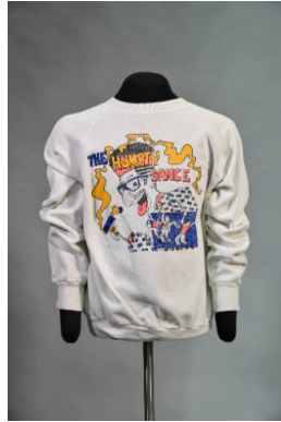
Title: Digital Underground Humpty Hump Sweatshirt Date: c. 1990 Primary Maker: Humpty Hump Medium: cotton (textile)