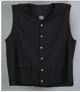
Title: 5001 Flavors Vest Formerly Owned by The Notorious B.I.G. Date: 1994-1996 Primary Maker: Notorious B.I. G. Medium: cotton