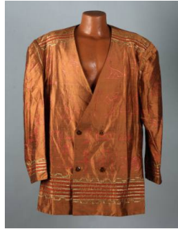
Title: Suit Jacket Formerly Owned by Professor X