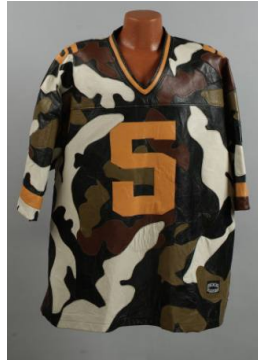
Title: Camouflage Football Jersey Formerly Owned by Silk the Shocker Date: c. 1998 Primary Maker: Silk The Shocker Medium: leather