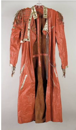
Title: Stage Jacket Formerly Owned by Scorpio of Grandmaster Flash & The Furious Five Date: c.1985 Primary Maker: Scorpio Medium: leather