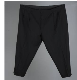
Title: Suit Trousers Formerly Owned by The Notorious B.I.G. Date: 1994-1996 Primary Maker: Notorious B.I.G. Medium: cotton