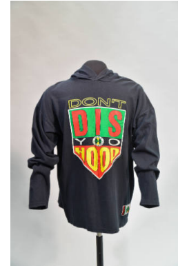
Title: Cross Colours "Don't Dis Yo Hood" Hoodie Date: c. 1995 Medium: cotton (textile)