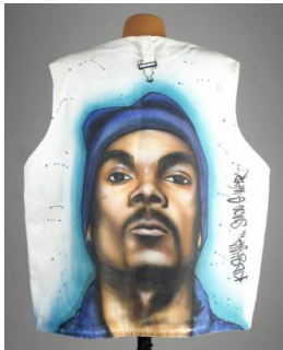
Title: Snoop Doggy Dogg "Murder was the Case" Kid Styles Airbrushed Denim Vest Date: c. 1994 Primary Maker: Snoop Doggy Dogg Medium: denim