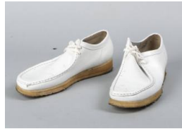
Title: Clarks Wallabees Shoes Formerly Owned by The Notorious B.I.G. Primary Maker: Notorious B.I. G.