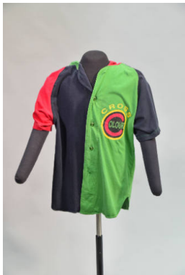
Title: Cross Colours Pan-African Color Block Hooded Shirt Date: c. 1995 Medium: cotton (textile)