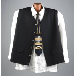
Title: Alexander Lloyd Necktie Formerly Owned by The Notorious B.I.G. Date: c.1995 Primary Maker: Notorious B.I. G. Medium: cotton