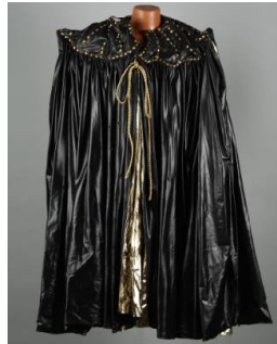
Title: Planet Rock Cape Worn by Afrika Bambaataa