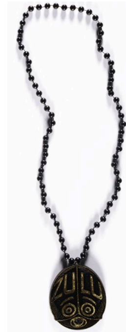
Title: Zulu Nation Pendant Date: c. 1975 Primary Maker: Zulu Nation Medium: metal