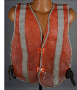
Title: New York MTA Transit Vest Date: c. 1984 Primary Maker: Metropolitan Transportation Authority (NY) Medium: polyester