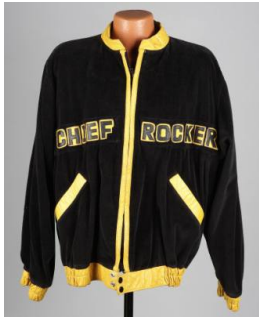
Title: Jacket Worn by Chief Rocker Busy Bee Date: c. 1986 Primary Maker: Busy Bee Medium: leather; velours