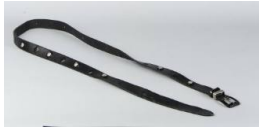
Title: Calé Belt Formerly Owned by The Notorious B.I.G. Date: 1994-1996 Primary Maker: Notorious B.I.G. Medium: leather