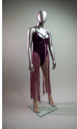
Title: Outfit Worn by Cardi B at the "Femme it Forward" Music Concert Date: 2019 Primary Maker: Cardi B Medium: polyester