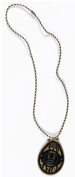
Title: Zulu Nation Pendant Formerly Owned by Afrika Bambaataa Date: c. 1970 Primary Maker: Afrika Bambaataa Medium: polyester; cord; metalwork