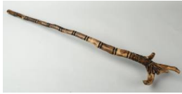
Title: "Renegades of Funk" Walking Staff Formerly Owned by Afrika Bambaataa