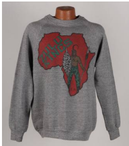
Title: Zulu Kings Sweatshirt Date: 1975-1990 Primary Maker: Zulu Nation Medium: cotton