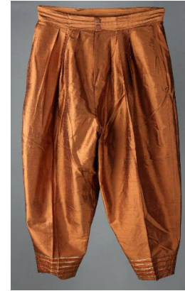
Title: Suit Trousers Formerly Owned by Professor X