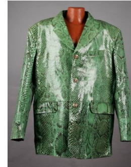
Title: 5001 Flavors Green Python Jacket and Pants Formally Owned by Master P Date: c.1996 Primary Maker: Master P Medium: snakeskin