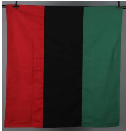
Title: Red, Black, and Green Striped Banner