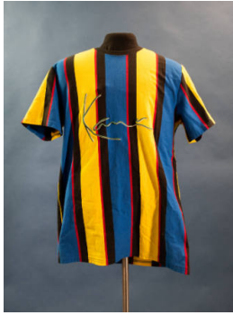
Title: Blue and Yellow Stripped Karl Kani Shirt Date: c. 1995 Primary Maker: Karl Kani Medium: cotton (textile)