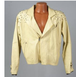
Title: Leather Jacket and Pants Worn by Kurtis Blow