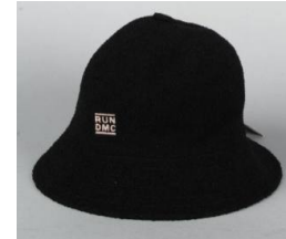
Title: Run DMC Kangol Hat Date: c. 1985 Primary Maker: Run-D.M.C. Medium: wool