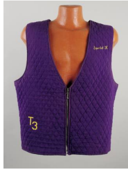
Title: T3 Vest Worn by Special K of The Treacherous Three Date: c.1994 Primary Maker: Special K Medium: cotton