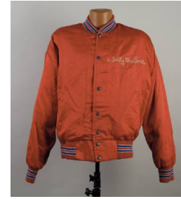
Title: "Bobby the Boss" Disco Four World Tour Jacket Date: c.1985 Primary Maker: The Disco Four Medium: polyester