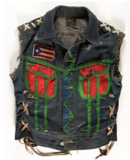
Title: Young Nomads Vest