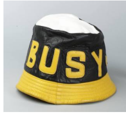
Title: Leather Hat Worn by Chief Rocker Busy Bee Date: c. 1987 Primary Maker: Busy Bee Medium: leather