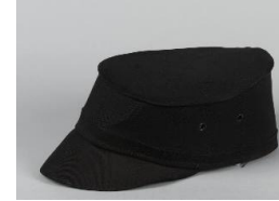
Title: Falcon Jump Up Hat Worn by Professor Griff of Public Enemy