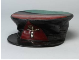
Title: Crown with Ankh Symbol Formerly Owned by Professor X