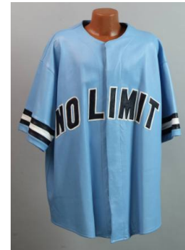
Title: Blue Leather No Limit Baseball Shirt and Pants Formerly Owned by Silkk the Shocker