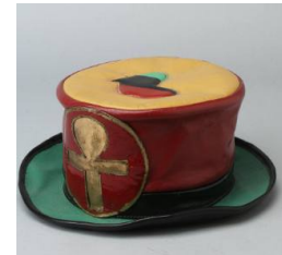
Title: Crown with Ankh Symbol and Outline of Africa Hat Formerly Owned by Professor X