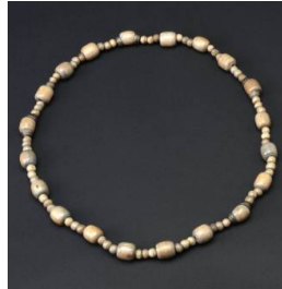
Title: Wood and Metal Necklace Formerly Owned by Professor X Date: c. 1990 Primary Maker: Professor X Medium: wood, metal