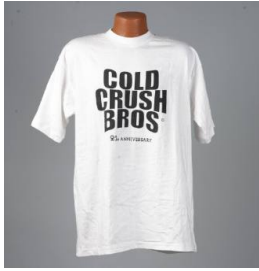
Title: Cold Crush Bros 21st Anniversary Promotional T-shirt Date: 1990-2000 Primary Maker: Cold Crush Brothers Medium: cotton