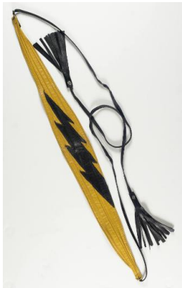
Title: Leather Cummerbund Worn by The Kidd Creole Date: 1978-1988 Primary Maker: The Kidd Creole Medium: leather