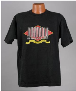
Title: Promotional T-shirt for Diamond and the Psychotic Neurotics: Stunts, Blunts, & Hip-Hop