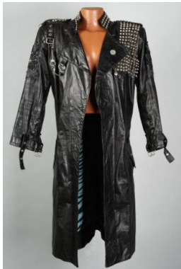
Title: Black Calf-Length Leather Jacket Worn by Melle Mel