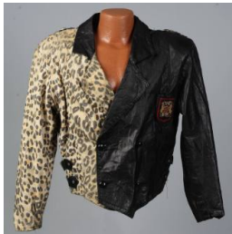
Title: Leopard-Patterned Jacket Formerly Owned by Rahiem of Grandmaster Flash & The Furious Five