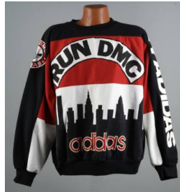
Title: Run DMC Adidas Sweatshirt Date: 1985-1990 Primary Maker: Run-D.M.C. Medium: cotton