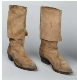
Title: Leather Boots Worn by The Kidd Creole of Grandmaster Flash & The Furious Five Date: c. 1984 Primary Maker: The Kidd Creole Medium: leather