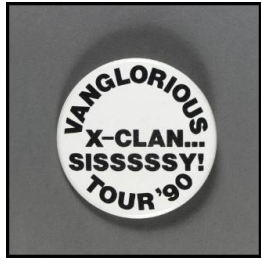
Title: Vanglorious X-Clan Sisssssy! Tour '90 Date: c. 1990 Primary Maker: X Clan Medium: metal, plastic and paper