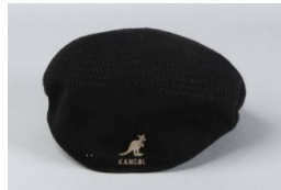
Title: Kangol Ventair Cap Worn by Grandmaster Flash