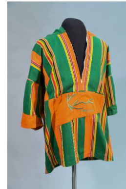
Title: Orange and Green Stripped Karl Kani Hooded Shirt Date: c. 1995 Primary Maker: Karl Kani Medium: cotton (textile)