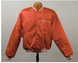
Title: Public Enemy Baseball Jacket Formerly Owned by Chuck D Date: c. 1990 Primary Maker: Chuck D Medium: polyester