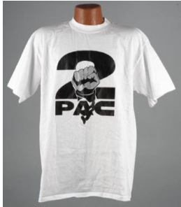
Title: 2Pac Tha N.I.G.G.A. Z. are Comin Promotional T-shirt Date: c. 1995 Primary Maker: Tupac Shakur Medium: cotton