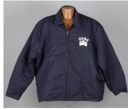
Title: 'Tha Dogg Father' D.P.G.C. Jacket Date: 1990-1995 Primary Maker: Tha Dogg Pound Medium: polyester, cotton (textile)