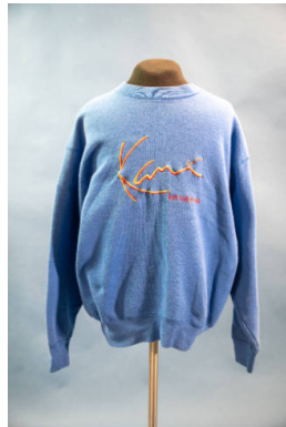
Title: Blue Karl Kani Sweater Date: c. 1995 Primary Maker: Karl Kani Medium: cotton (textile)