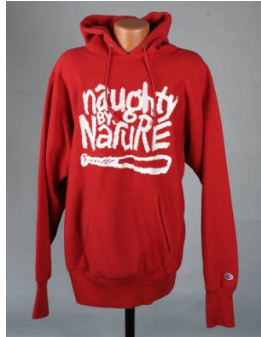
Title: Hooded Sweatshirt Worn by Kay Gee of Naughty by Nature Date: c. 1995 Primary Maker: Kay Gee Medium: cotton