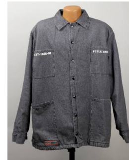
Title: Rapp Style "inmate" Denim Jacket Formerly Owned by Chuck D