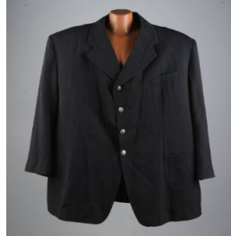
Title: 5001 Flavors Jacket Formerly Owned by The Notorious B.I.G. Date: 1994-1996 Primary Maker: Notorious B.I. G. Medium: cotton