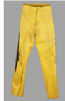
Title: "Creole" Leather Pants Worn by The Kidd Creole Date: c. 1984 Primary Maker: The Kidd Creole Medium: leather