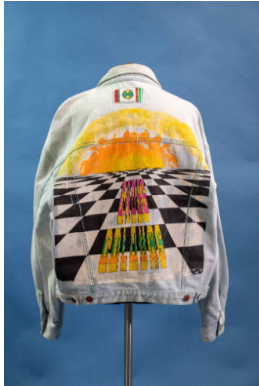
Title: Cross Colours Graffiti Demin Jacket Date: c. 1995 Medium: cotton (textile)