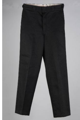
Title: Stage Pants Worn by Professor Griff of Public Enemy