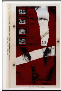
Title: Original artwork mechanical for C/Z Records 7" vinyl compilation Teriyaki Asthma Volume Four, 1991

Medium: paper (fiber product); ink; Mylar (TM); masking tape